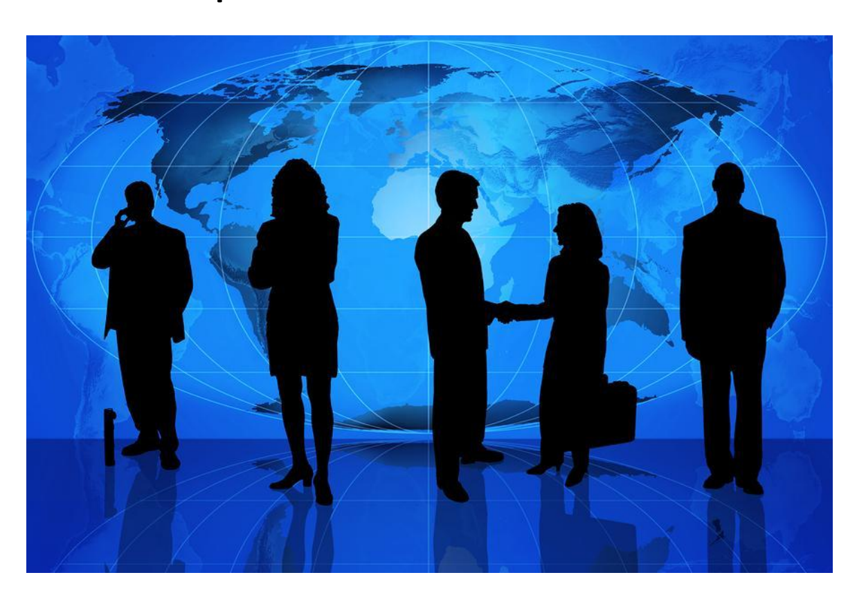
BFU: Capitalism and Investment